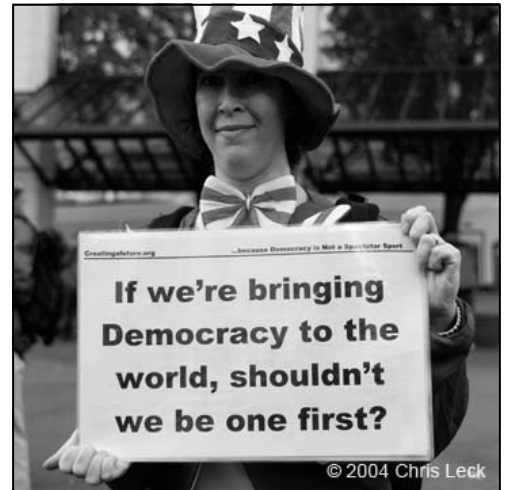
Protester on the streets of Portland, Nov. 3, 2004.