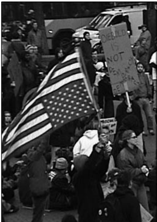
Protesters in Portland, Nov. 3, 2004. Sign says, "Diebold is not Democracy". Diebold has connections to the Republican Party and makes electronic voting machines that are easy to hack.